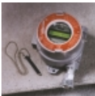
FX-SMT (LEL or PPM) (combustible)