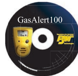
Interactive Product Demo CD-ROM